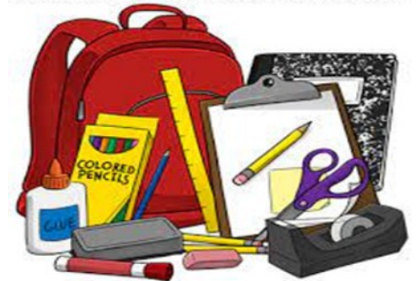
SCHOOL SUPPLIES CLIPART

The need for mite contributions continues. Please empty your mite box into the large mite box on the LWML table or just set your mite box on the table and take a new box. Seventy-five percent of mite donations remain in the FL-GA district mission grants and 25% is forwarded to national LWML for their mission grants.