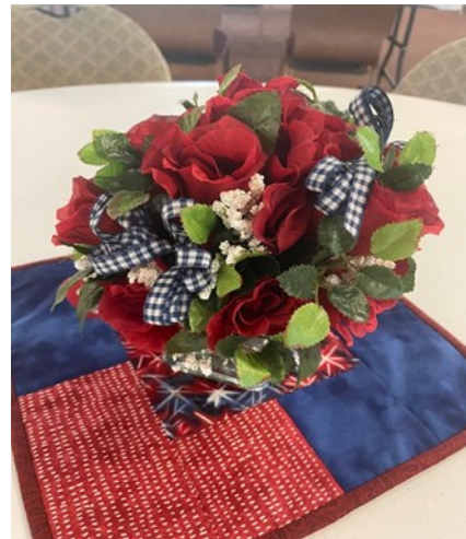
Great Hall table centerpieces show our colors on this Memorial Day.

America's White Table A place setting for One, A table for All