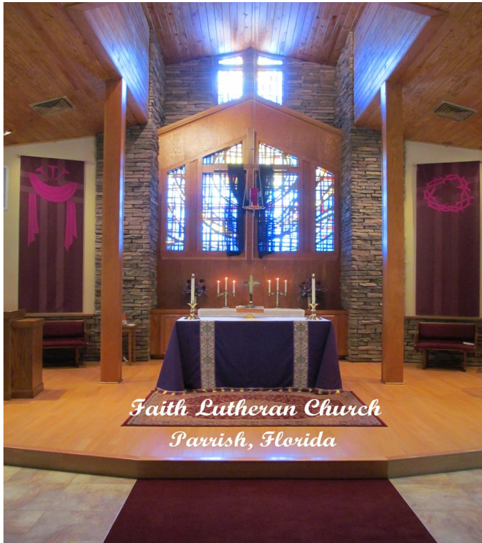
Faith Lutheran Church Parrish, Florida