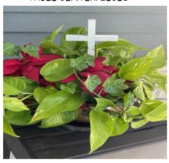
EVERYONE RECEIVED A WHITE CROSS