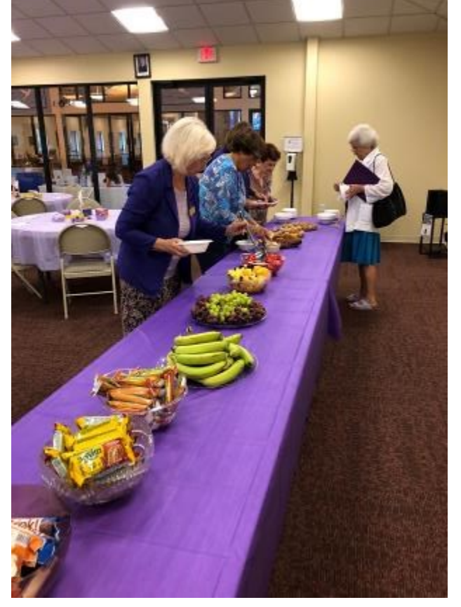
BREAKFAST TABLE OF GOODIES