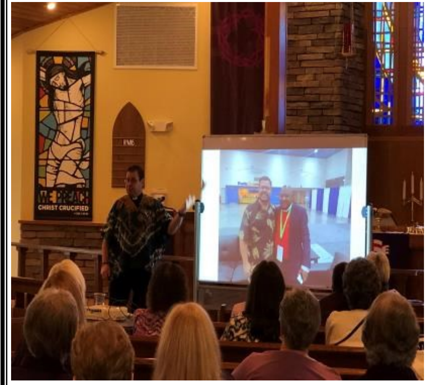
PASTOR SHARING HIS SOUTH SUDAN EXPERIENCES.