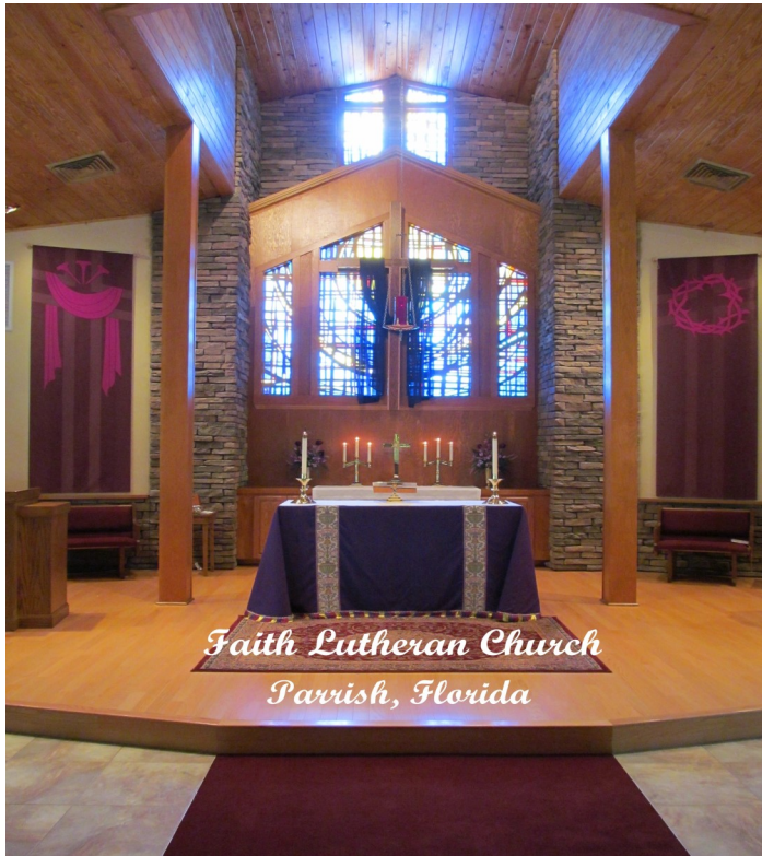
Faith Lutheran Church Parish, Florida