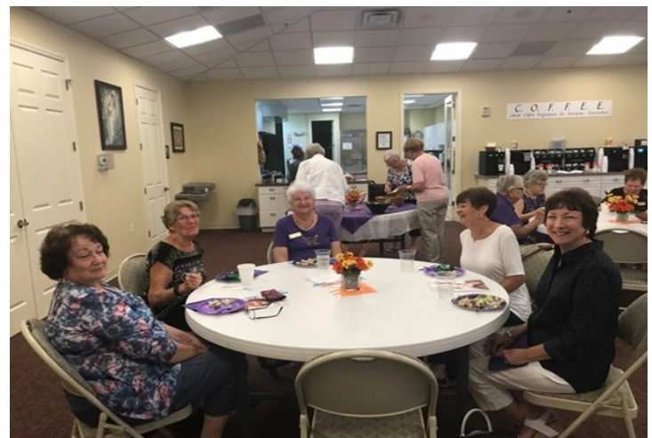
Prayer Service Salad Luncheon was enjoyed by all.