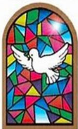
They will receive blessing from the Lord and vindication from the God of their salvation. Psalm 24:5

Within the Lutheran religion and following Reformation Day on October 31st, All Saints' Day is celebrated on November 1st. For the parishioners within the religion, "the day is observed by remembering and thanking God for all saints, both dead and living." It is a day to glorify Jesus Christ, who by his holy life and death has made the saints holy through Baptism and faith.